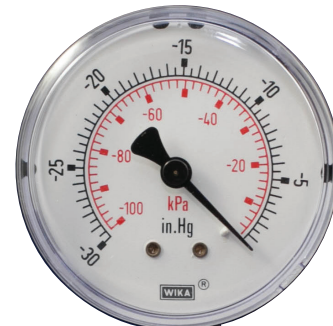
Gauge Not Included